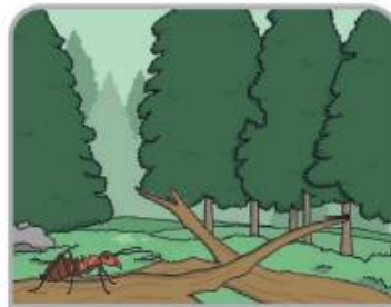
inside rotting wood