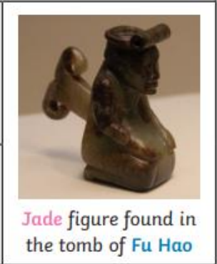
Jade figure found in the tomb of Fu Hao

The skeletons of six dogs and 16 humans were also found in the tomb. These were probably Fu Hao's pets and advisers, sacrificed to accompany her into the afterlife.